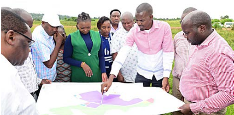
Officials from the Ministry of Investment, Trade, and Industries, National Treasury, the Kenya Industrial Research and Development Institute, and County Government at the Sagana Industrial Park site.

He said aggregation and industrial parks are one of the most sustainable efforts by the national and county governments to shape Kenya's economy by targeting specific inclusive economic activities.