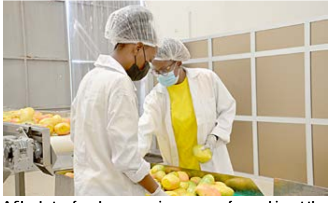
A file photo of workers preparing mangoes for crushing at the CDA Fruit Processing Plant in Tana River

Tana River is one of the major mango-producing counties. But besides mangoes, the plant can crush other fruits including pineapples, watermelons, and