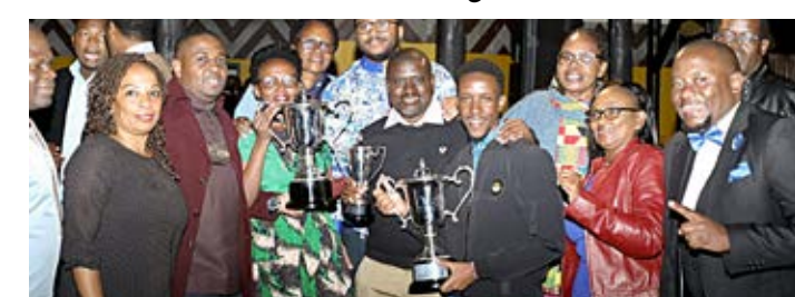
Kenyan delegation celebrates their award in Zimbabwe

The outstanding organizations were awarded trophies for showcasing best innovation project practices in service delivery.