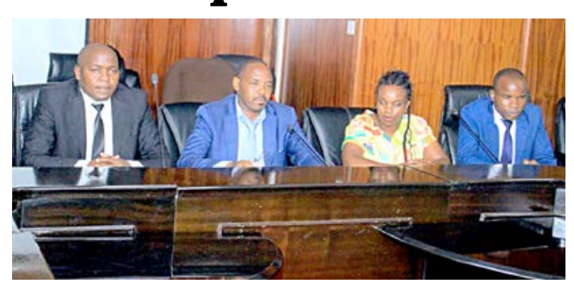
State Department for Crops Development staff during the press briefing.