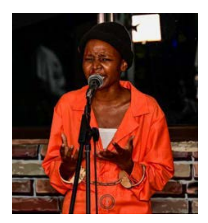
An artist performs at the recent festival in Kisumu to honor victims of the Garissa University attack

On April 2, 2023, a group of youth in Kisumu converged at a hotel in Kisumu. The somber occasion was to honour the lives of the 147 people, most of them students, who perished in the terrorist attack on the morning of April 2, 2015 at the then Garissa University College (GUC).