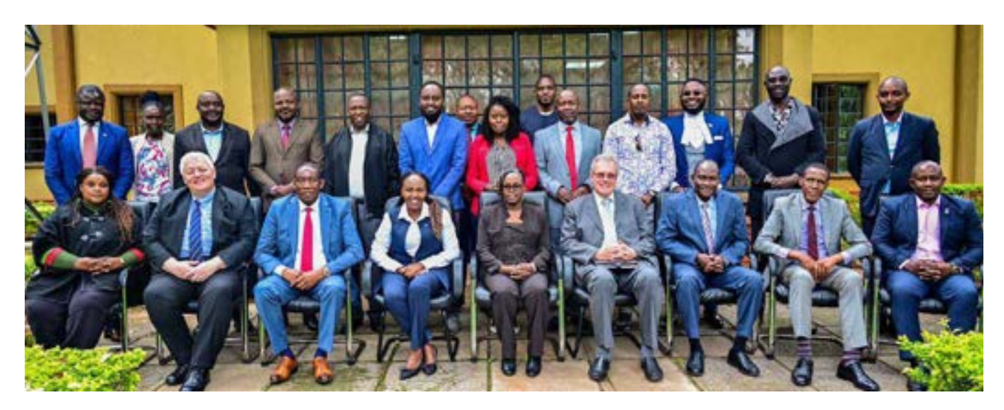
A delegation from Kenya Private Sector Alliance after holding consultations with the National Counter Terrorism Center.

The Kenya Private Sector Alliance (KEPSA) and the National Counter Terrorism Center (NCTC) have agreed to deepen their collaboration in training and capacity building in counter terrorism (CT) targeting the private sector. This was one of the decisions arrived at when a delegation from KEPSA visited the NCTC headquarters on April 14.