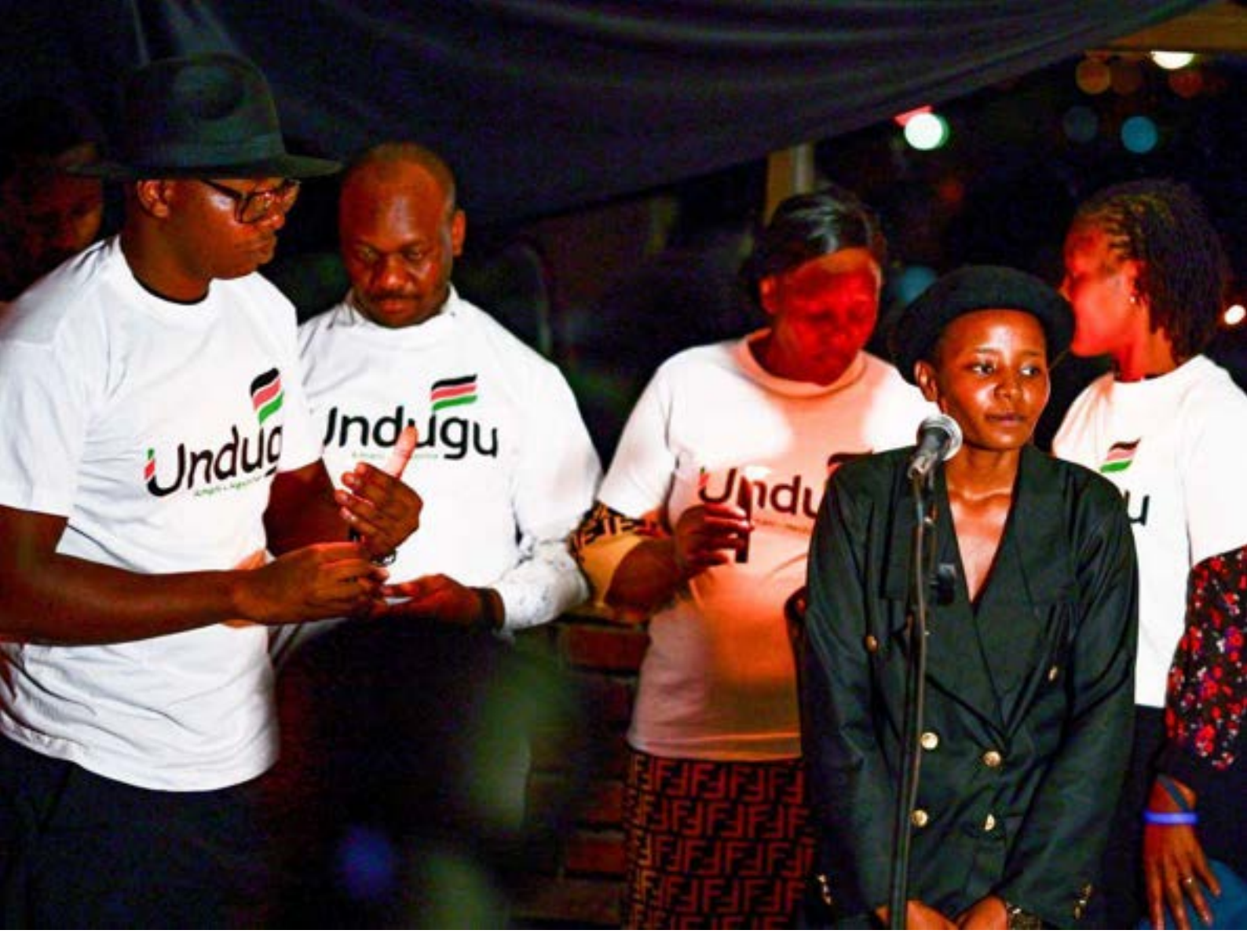
Pamojani Arts Group based in Kisumu organized an arts exhibition dubbed 4:02 to commemorate the lives of the 147 people who perished in the Garissa University College attack on April 2, 2015. The event was supported by the National Counter Terrorism Center.