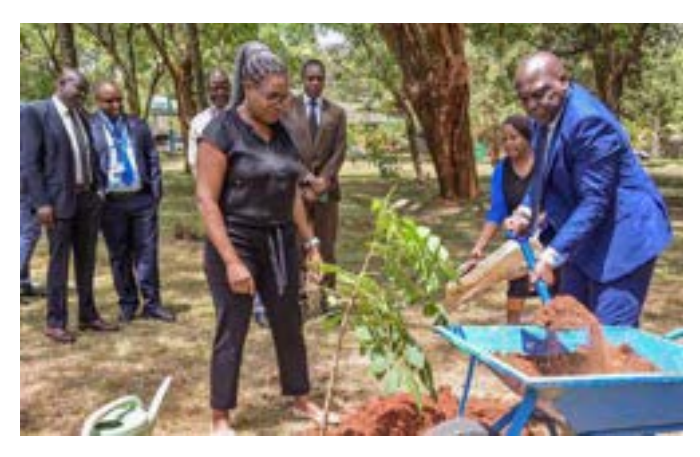
A delegation from the Eastern and Southern Africa Anti-Money Laundering Group (ESAAMLG) visited Kenya as part of a knowledge sharing program with the National Counter Terrorism Center. Here, members of the ESAAMLG team are seen planting a commemorative tree at the Center.